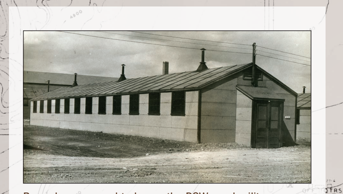
Barracks were used to house the POWs and military personnel. Rows of bunk beds lined each side of the barracks, accommodating up to 50 men.