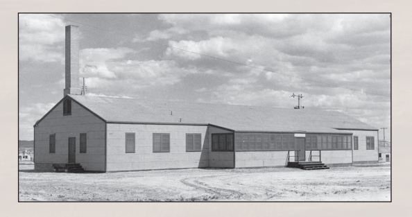
The Officers' Club is the only intact structure left from Camp Douglas

The Officers' Club housed the Douglas Lodge #15, Independent Order of Odd Fellows starting in 1963.